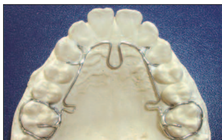
Advanced Lightwire Functionals