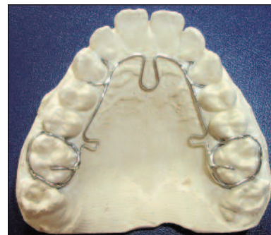
Figure 1 - ALF appliance

The ALF appliance was inspired by Crozat and Kernot Universal Lightwire appliances. With an Elgiloy yellow body wire of 0.025" or 0.028" thickness (about 0.6 to 0.7 mm) the ALF has a high degree of flexibility. It uses the teeth as handles to affect the alignment of cranial bones and change craniosacral motion ... for better or for worse - it all depends on the dentist's skills when making adjustments.